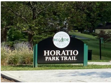
Playground Monument Sign