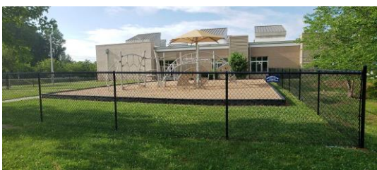
Fencing for playground perimeter