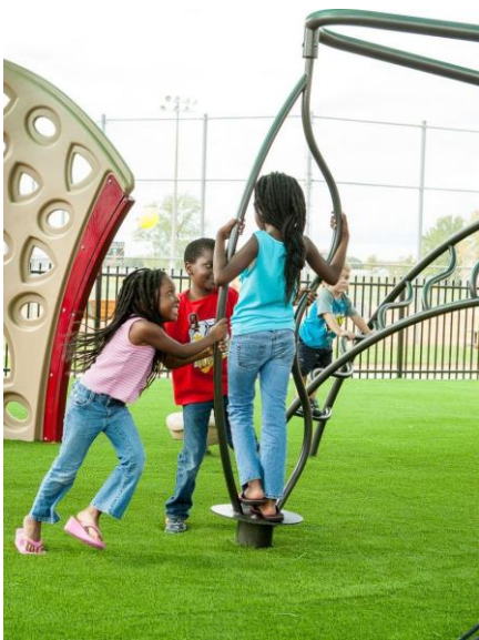
Synthetic Turf Playground Surface