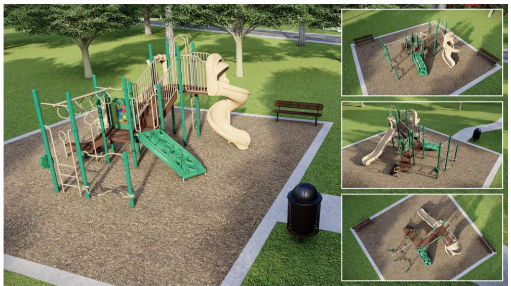
Ultimate Adventure Playground