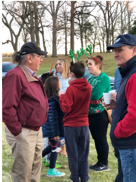
Residents enjoying the annual visit from Santa at the new Gazebo last December